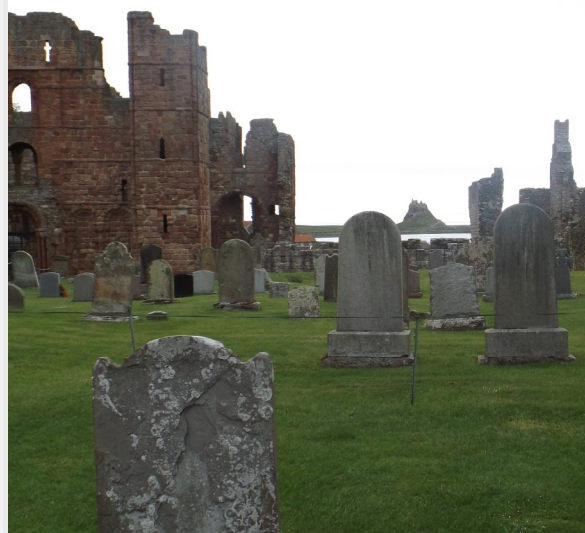
Lindesfarne Abbey ruins with castle in background where we worshipped.