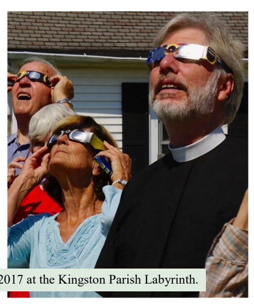
Members of the community viewing the last Total Solar Eclipse on August 21, 2017 at the Kingston Parish Labyrinth.