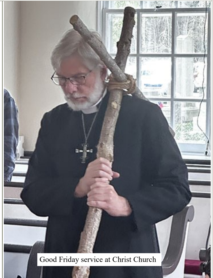
Good Friday service at Christ Church